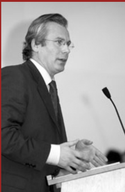
Baltasar Garzón , made famous by his attempts to extradite General Pinochet, seeks to establish an international criminal court.