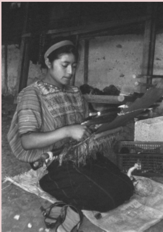
Photos on the Guatemalan section of the “Expressions of Central America” educational website demonstrate Mayan weaving