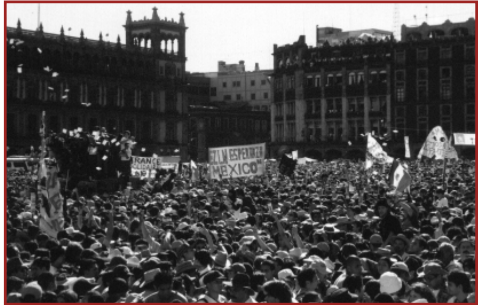
Thousands crowd Mexico City’s Central Plaza at the culmination of the “zapa tour” to demand greater indigenous rights.

The wave of euphoria was to last a mere few weeks. By the middle of July, both the federal legislature and the majority of state Congresses approved a water-downed version of the original law initiative. However, the states where 80% of Mexico’s 10 million indigenous people reside flatly rejected the law. I was visiting the EZLN support base communities where I had worked for several years when the radio announced that the state congresses had taken the final step and approved the reforms drafted by Congress. Several Tzeltal men and I were sitting in the