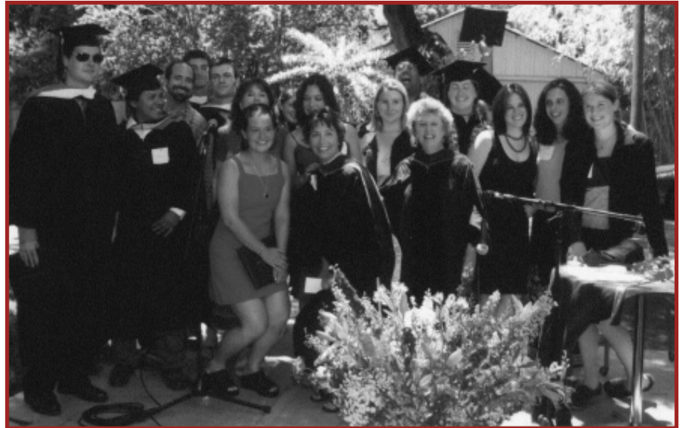
The 2001 BA and MA classes celebrate after the graduation ceremony at Bolívar House.