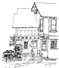
Casa Bolívar, Stanford University